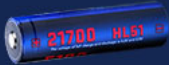
21700 5100mAh li-ion battery